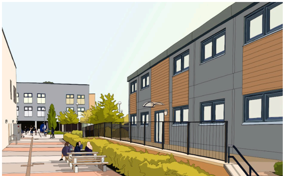
Architect's illustration of the new block

Our major #BEST development is to replace the existing portacabin (the Pupil Support Centre - PSC) with a larger sustainable modular building. This will add 4 classrooms to the space in addition to replacing the current PSC and pastoral hub. A planning application has been made and will soon be available to view on the Welwyn Hatfield planning portal REF: 6/2025/0191/MAJ. The planning team has already given us positive feedback on our pre-planning application.