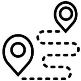
Trips and Visits